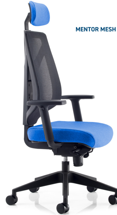
MENTOR MESH - MTM1A