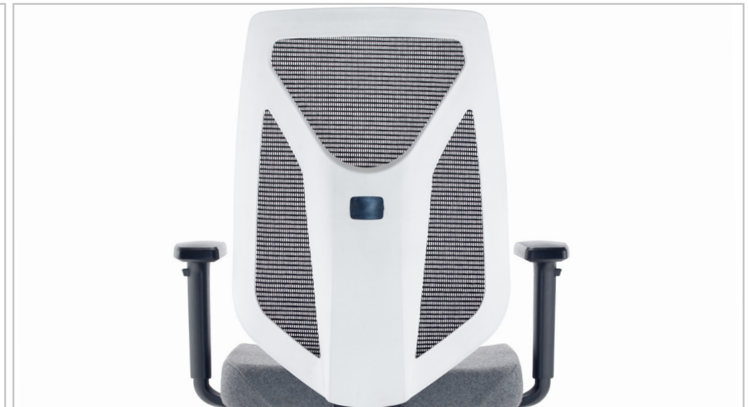
MENTOR MESH - WMTM2A