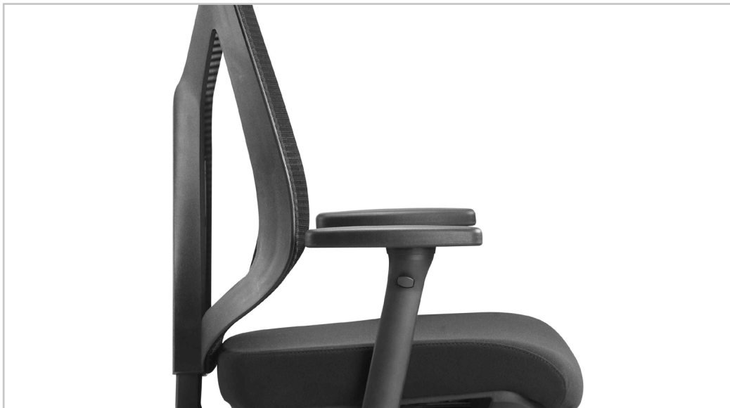
MENTOR MESH - MTM2A