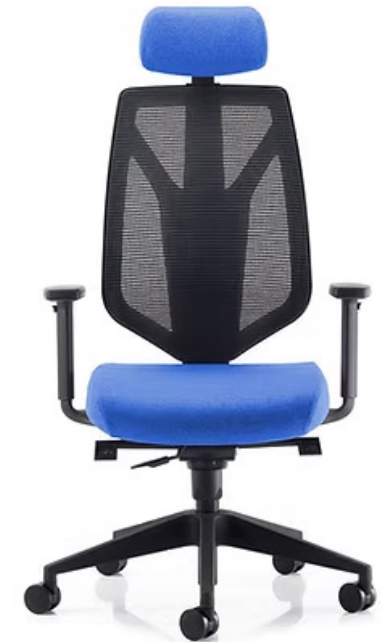
MENTOR MESH - MTM1A